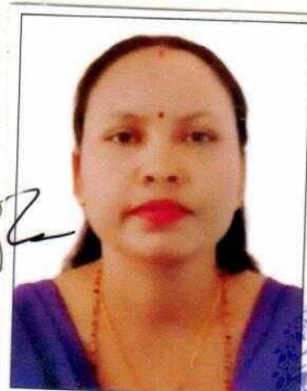
Donor EMBASSY OF NEPAL New Delhi